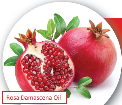
Rosa Damascena Oil

The EU Medicines Agency reported positively on the Rosa Damascena flower oil as a Traditional Herbal Medicine.